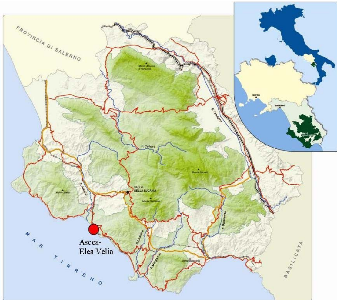
Figure 2: Location of Cilento, Vallo Diano and Alburni National Park-Geopark and Ascea-Velia-Elea

The 12th European Geoparks Conference will be held in Ascea-Velia-Elea, village located along the coast of the Cilento, Vallo Diano and Alburni National Park-Geopark, in the the Campania Region southern Italy (fig.2).